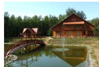
Napkor-Harangod Forest School